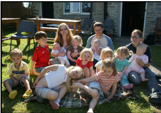
Young participants enjoy the Barn in Springtime

For many years we have supported the International Religious Fellowship (an association of liberal religious young people throughout the world).