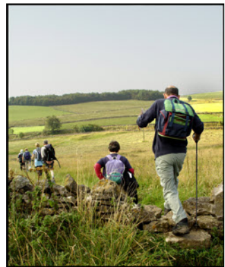
Walking in the September sunshine

Foy members enjoy opportunities to meet and study together as they explore current issues and problems. We treasure the atmosphere of tolerance which allows free speech. Ideas are developed in diverse but supportive groups. Experiences and insights into social issues are shared in order to achieve deeper understanding as a basis for informed and responsible action. Foy plays a valuable part in the spiritual lives of its members. It provides learning, personal growth, friendship and relaxation.